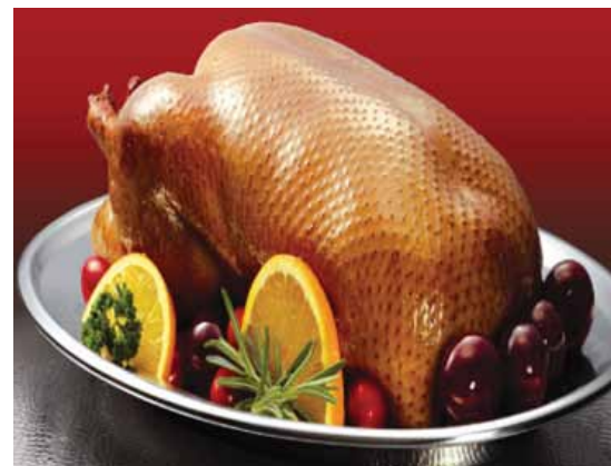
Top and above: Bangkok Ranch has evolved into a duck processing company with large upstream operations.