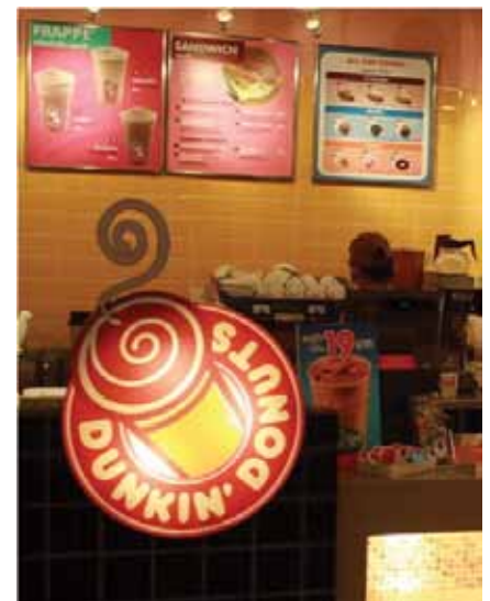
Navis' food and agribusiness portfolio also features a number of acquisitions in fast food restaurants such as Dunkin Donuts.

With Golden Foods, which was acquired in September 2009, Navis is not planning so much to turn the company around but to work on expansion.